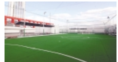
JOGARBOLA, rooftop futsal court

Filled with shopping, gourmet, and events! Come to ATC, jam-packed with charm, with something for everyone's satisfaction!!