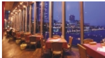
JACASSE, casual Italian restaurant