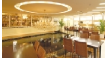
ETSU, restaurant for diabetics

From casual fast food to ethnic cuisine, restaurants of genuine taste, Japanese food, bars, buffet, also a specialty restaurant for diabetics, lined up with restaurants catering to various tastes. Gazing at the ocean spreading out in front of you, enjoy good food and a moment of relaxation.