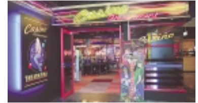
TAKARAJIMA, casino & amusement

Full of amusement facilities; Game Center "TAKARAJIMA" to enjoy various games, the first official Bae Yong Joon Museum outside of Korea "PARK BOF JAPAN", rooftop futsal court "JOGARBOLA", and indoor aquarium "Marine Square".